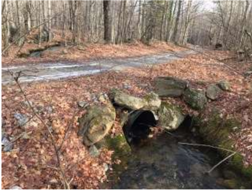
Looking west from Mile 0.9 (after Butler camp)